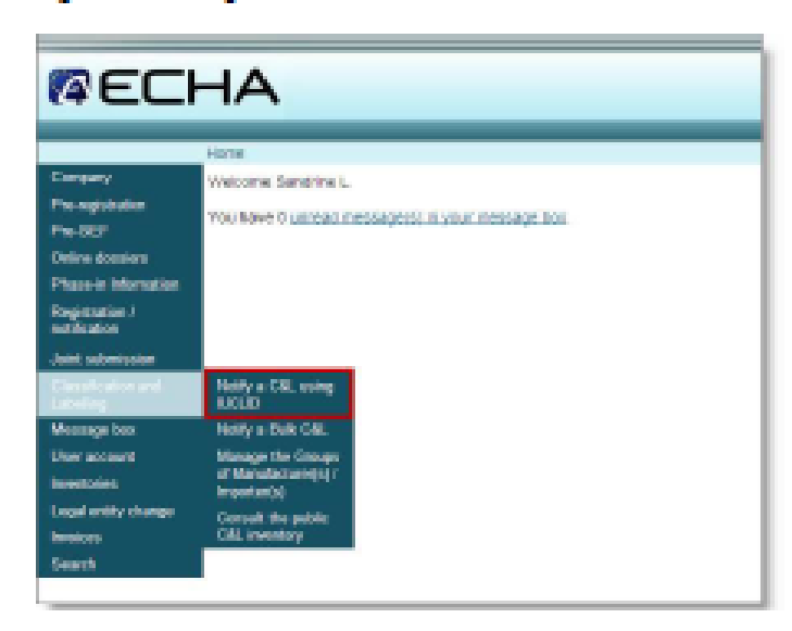
Figure 80: Starting a notification submission

To start the dossier submission, go to the «Classification and Labelling» menu, and click on «Notify a C&L using IUCLID» (Figure 90)